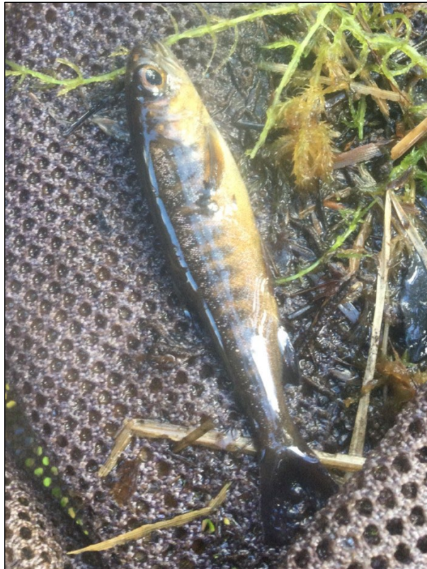
Figure 1.—Juvenile coho salmon captured at waypoint 1861.