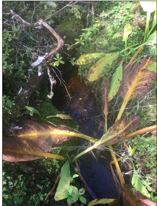
Figure 2.—Channel at waypoint 1861.